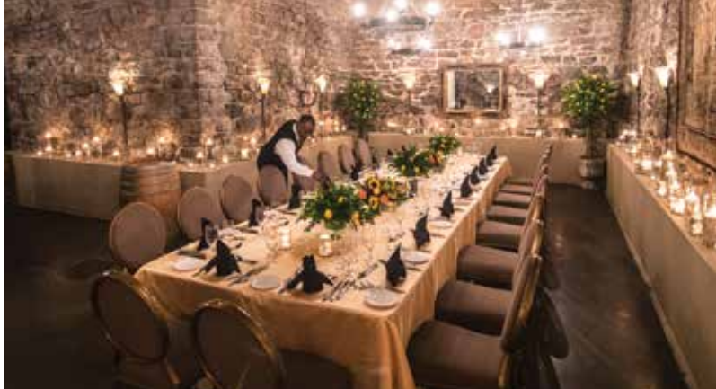
Champagne Cellar at the Winery

Main Barn & Courtyards: For up to 300 guests