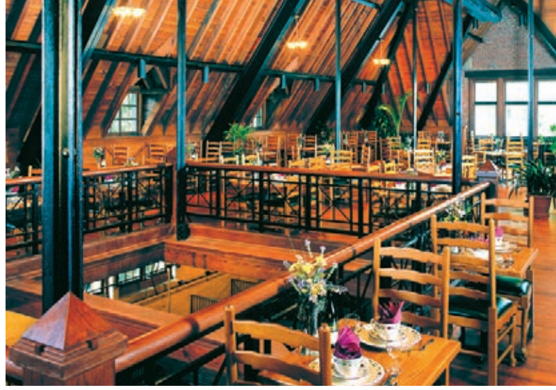
Stable Café Loft

Located adjacent to Biltmore House, Stable Café Loft is a wonderful dining space for groups seeking privacy and convenience. For groups of up to 120 people