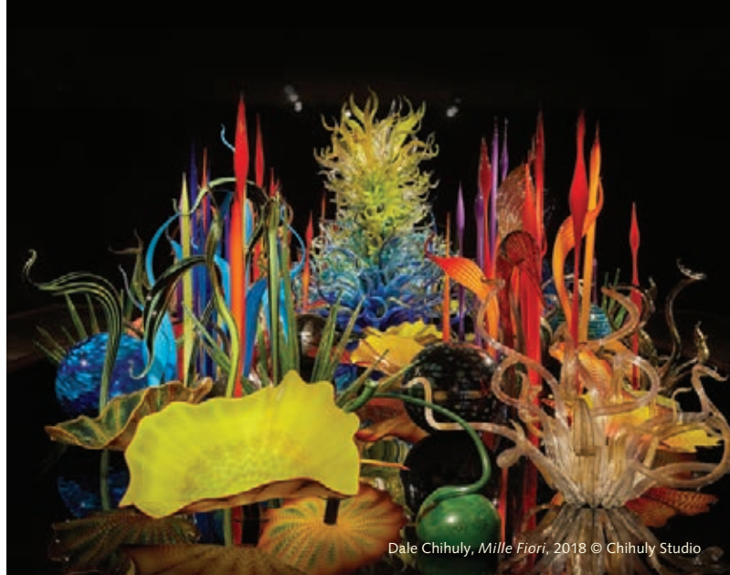
Dale Chihuly, Mille Fiori , 2018 © Chihuly Studio